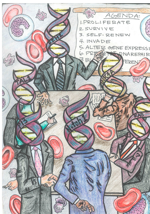
Unexpected signaling crosstalk underlies resistance to targeted therapy (Created by Caitlyn Webster; courtesy of Monique Dail and Kevin Shannon).

Years of efforts have been invested in developing targeted cancer therapies by identifying the unique features of cancer cells and designing specific molecules to eliminate them while sparing their healthy neighbors. Spurred on by the initial success of imatinib mesylate in treating Philadelphia chromosome-positive leukemia, the emergence of resistance to targeted therapies caught many off guard. Where is the resistance coming from? What makes the persisters special? And how might we stage a counteroffensive?